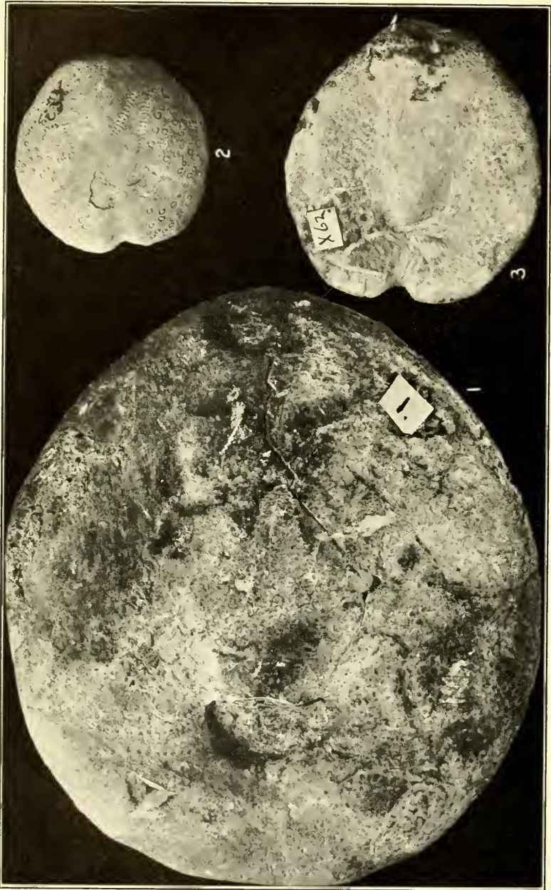
1, Eupatagus mexicanus , new species, Mesón formation, Hacienda Santa Fé, Topila, Mexico, Corona collection no. 1, holotype, ventral view of same specimen as pl. 14; 2, Loxocia mexicana , new species, Rancho Nuevo, 2.5 km W SW. of Meson, Canton Taxpan, Veracruz, W. F. Cummins collector, Calif. Acad. Sci., locality X62, holotype, dorsal view; 3, L. mexicana , same locality and collector, paratype, ventral view of a larger specimen than fig. 2. (Five-sixths natural size.)